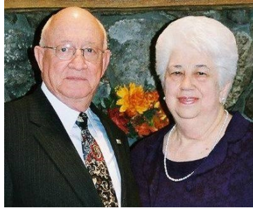
HHM - Christmas Letter - 2014 -Philippians 4:6-

“Be careful for nothing; but in everything by prayer and supplication with Thanksgiving let your requests be made known unto God. ”